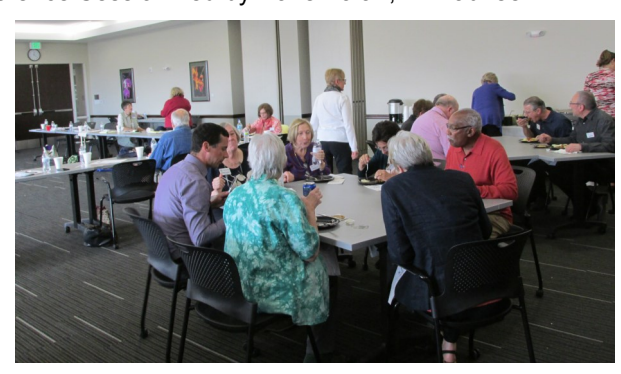
Lunch Discussion Group