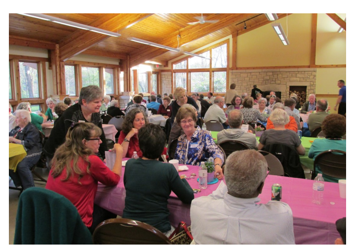
Welcome Party at Squaw Creek Park