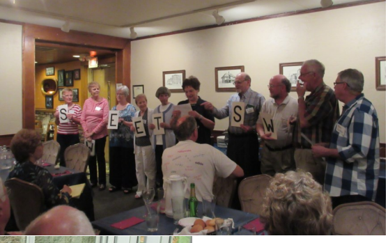
Playing word games at the farewell dinner