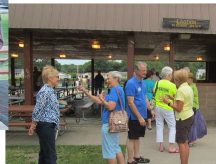
Welcoming guests to the picnic