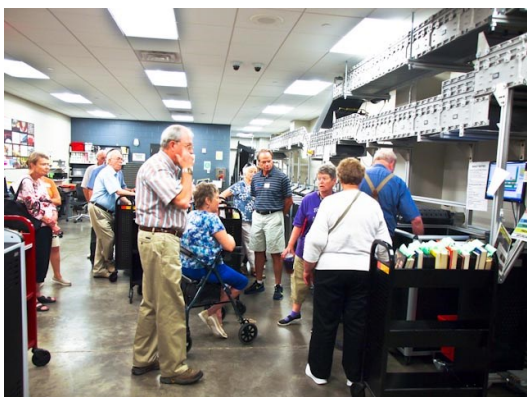
Watching the automated book return process at the Public Library