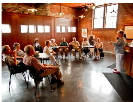
Learning about the artist Grant Wood and touring his studio