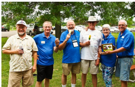
Corn hole competition winners!