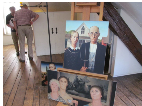
Viewing the Grant Wood window at the Veteran Memorial Building