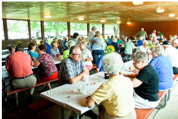
Club members get acquainted