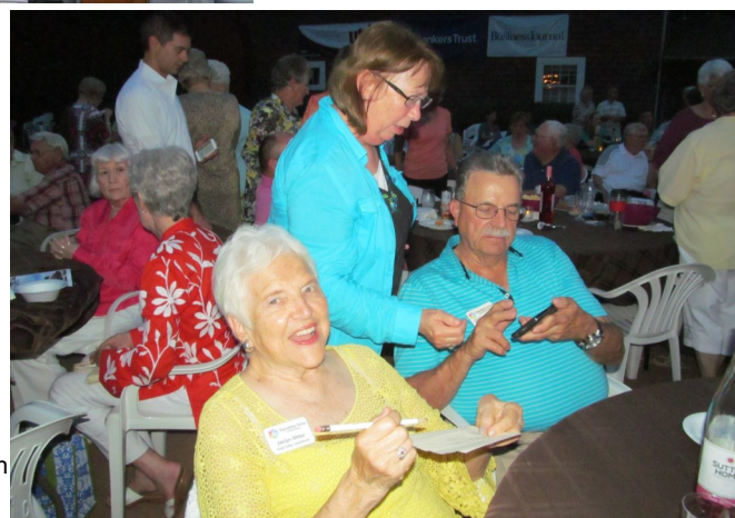
Enjoying music and conversation at Cabaret at Brucemore