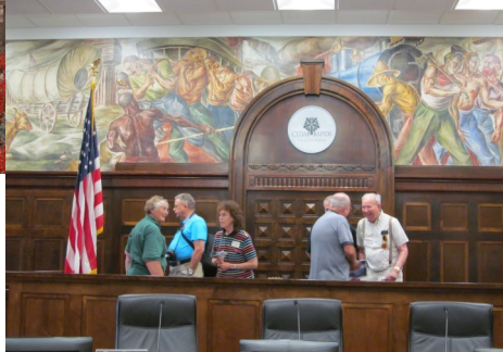
Viewing the murals in City Hall Council Chambers