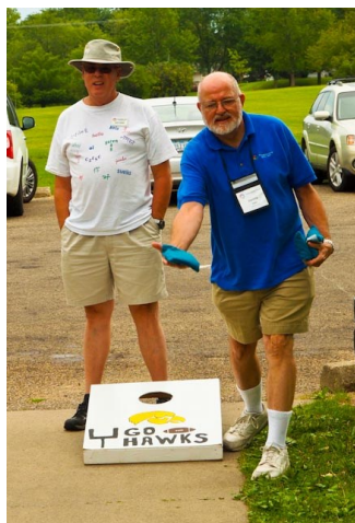
Corn hole competition

On Saturday, August 8, 79 Friendship Force members from Cedar Rapids-Iowa City, Central Iowa, Des Moines and Quad Cities attended the first All Iowa Club picnic. They enjoyed conversation, competition and great food.