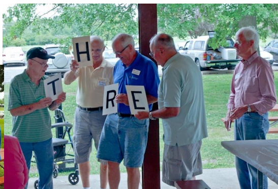
The men's team spells a word in the Story Game.