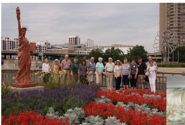
Touring downtown Cedar Rapids,