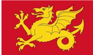
Flag of Wessex, England