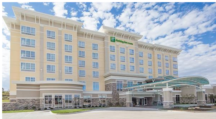
Conference is at the brand new Holiday Inns and Suites Davenport, 4215 Elmore Avenue, which has easy access to I-80.

Onsite is Davenport's newest hot spot, The J-bar, a very trendy full service bar and restaurant showcasing craft beers, award winning cocktails, extensive wines, and culinary inspirations to please you.