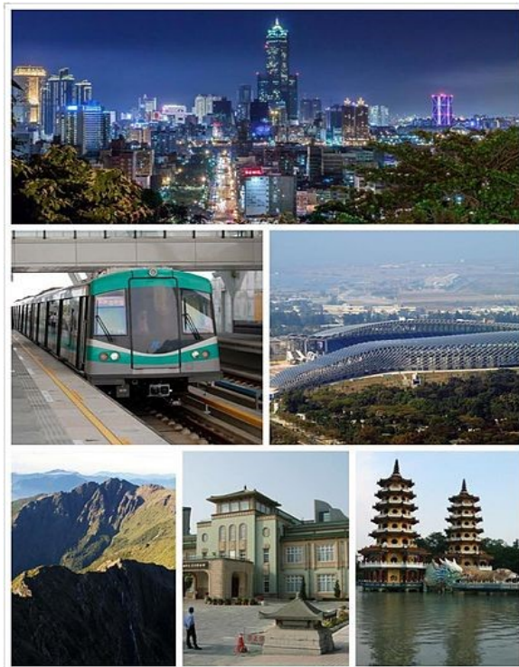
Scenes from Kaohsiung