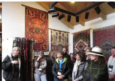
Native American Weavings