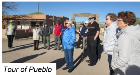
Tour of Pueblo