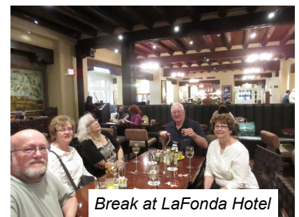
Break at LaFonda Hotel