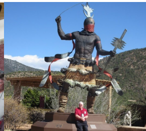
Museum Hill, Santa Fe