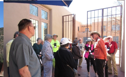
Learning about Georgia O'Keefe