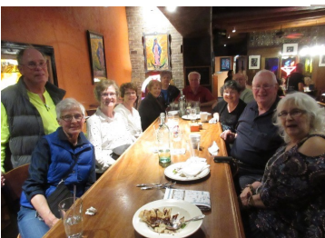
Enjoying New Mexico cuisine