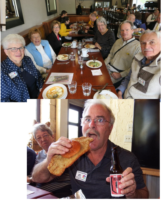
Enjoying an Iowa tenderloin at the General Store Pub in Stone City