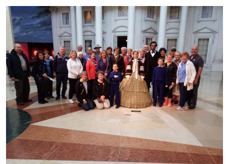
At the Lincoln Museum & Library in Springfield, IL