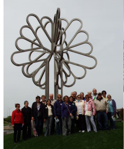
Downtown Cedar Rapids