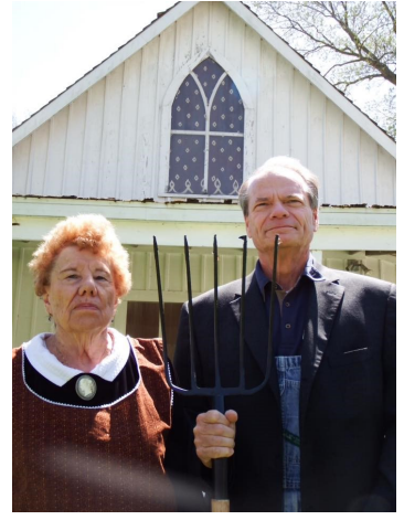
Recreating American Gothic at Stone City