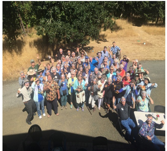
Moonfall Over Oregon Ambassadors and Hosts