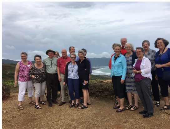
Kenting National Park-Pacific