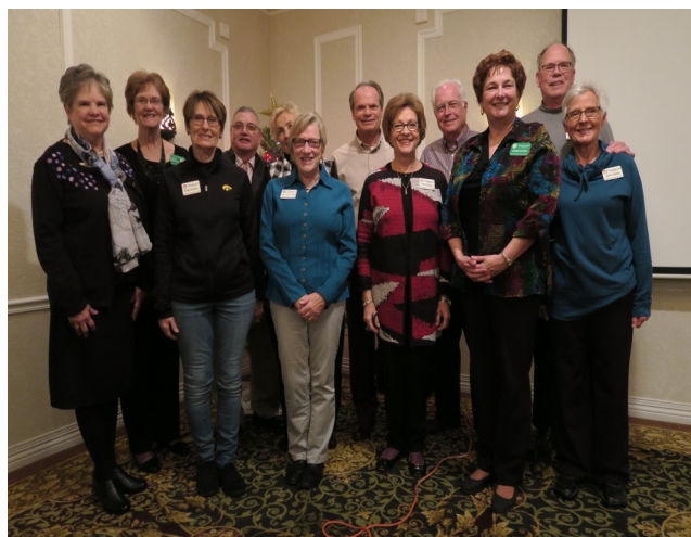
The 2018 Board of Directors