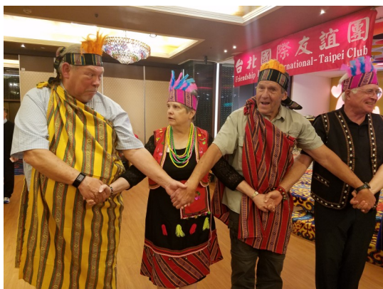
Taipei Farewell Party