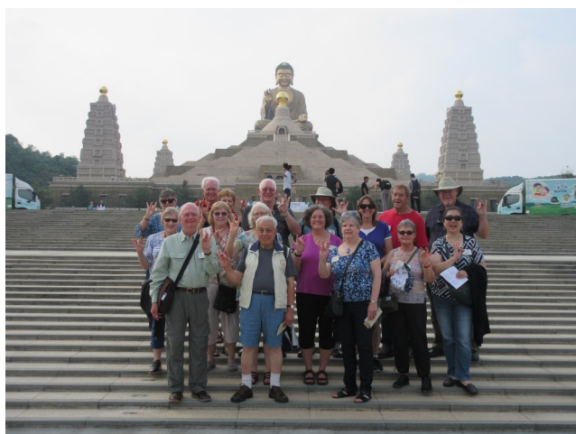
Buddha Memorial Park