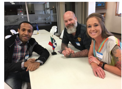
Visiting students and their mentor families