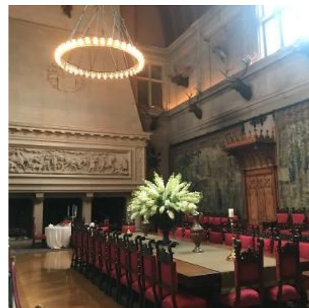
Where the Vanderbilt's ate

bilt enlisted architect Richard Morris Hunt to design and build a 250-room chateau. Landscape architect Frederick Law Olmsted was also hired to create formal gardens and transform the former farmland into a beautiful pastoral landscape.