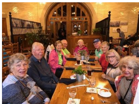
Lunch in the stables

George Vanderbilt visited Asheville, NC, in 1888 and was captivated by the area's natural beauty. He slowly began purchasing land and ended up with 125,000 acres for his country estate. Determined to make this a self-sustaining home, Vander-