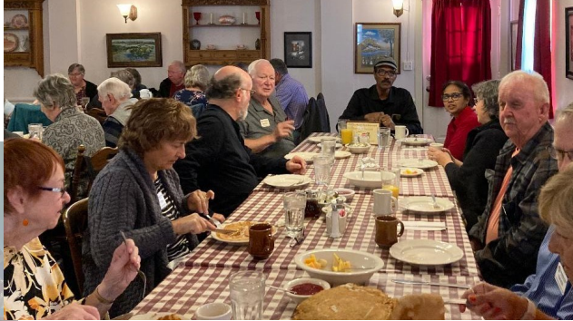
A "light" lunch in Kalona