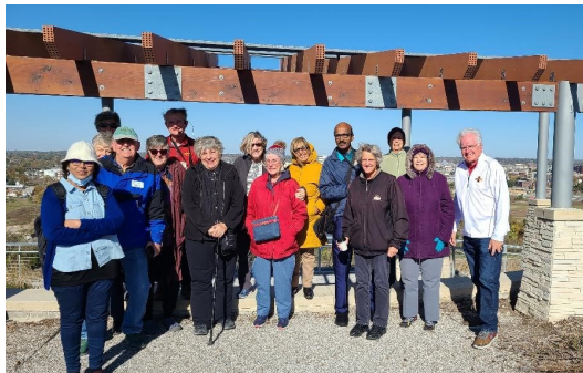
Touring Cedar Rapids