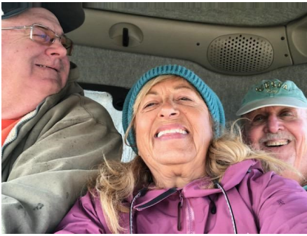
Combining corn on the Malickly farm