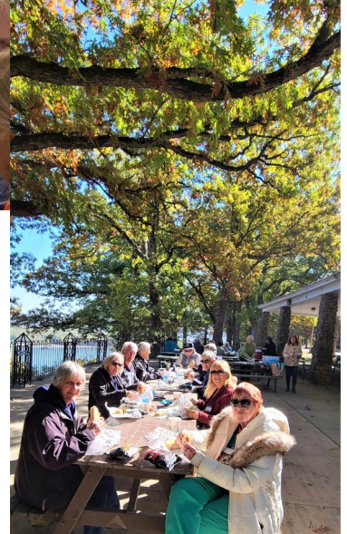
Lunch at Eagle Point Park