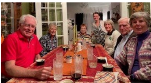
Home hosted Dinners