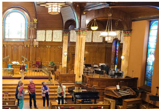
Admiring Tiffany Window In Dubuque