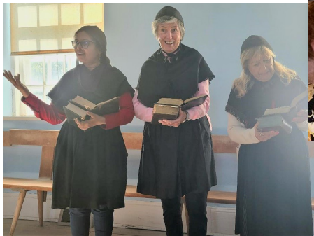
Touring the Amana Colonies