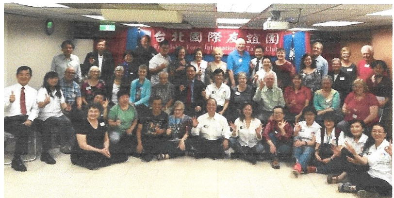
Our club's welcome to Taipei on 2017 Journey