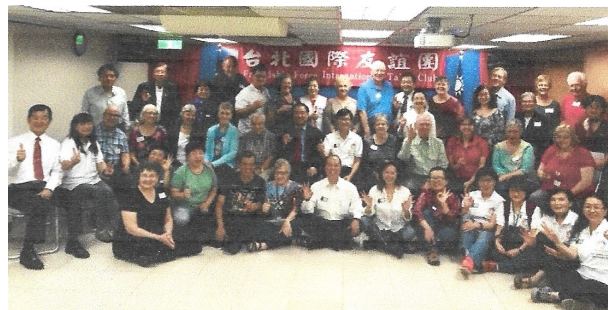
Our club's welcome in Taipei on 2017 Journey