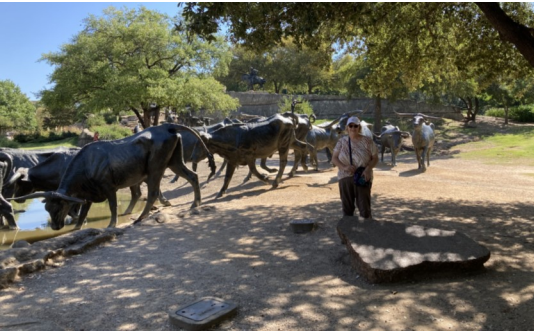
Cattle Drive Sculptures in downtown Dallas

son and Cedar Rapids several years ago, it was especially gratifying for ambassadors and hosts to see each other again.