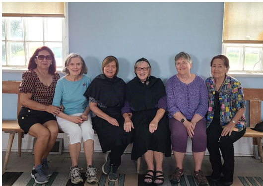
Touring the Amana Colonies