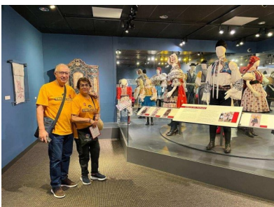
Czech & Slovak Museum