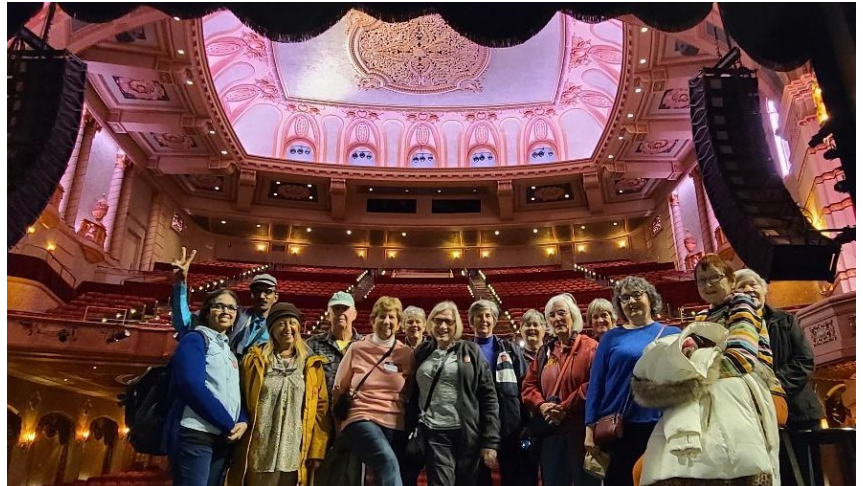
On the stage at the Paramount Theater