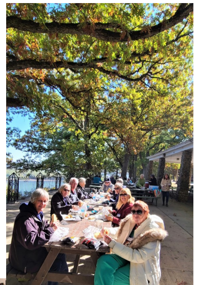
Lunch at Eagle Point Park, Dubuque, IA