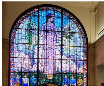
Grant Wood Window, Veterans Auditorium