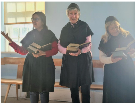
Touring the Amana Colonies