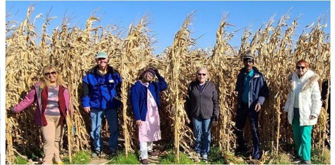
Field of Dreams Dyersville, IA