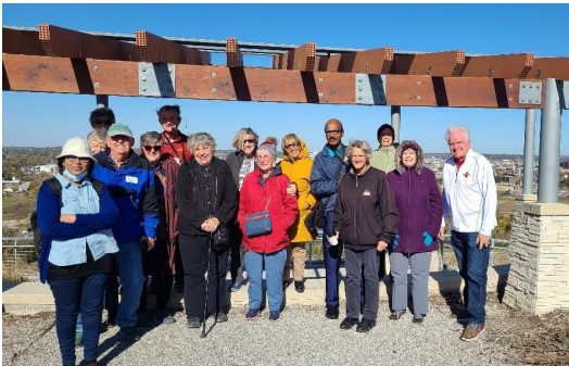
Top of Mount Trashmore