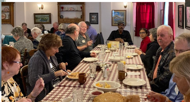
A "light" lunch in Kalona, IA