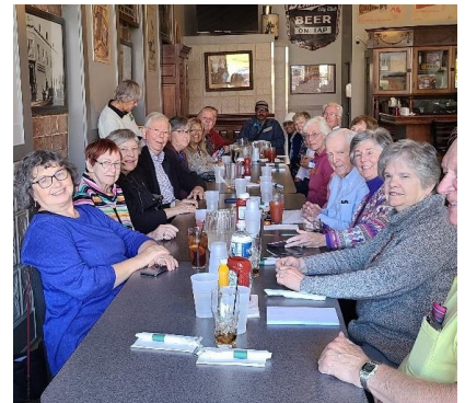
Lunch at Parlor City