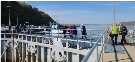
Surveying the Lock and Dam on the Mississippi River, Dubuque, IA