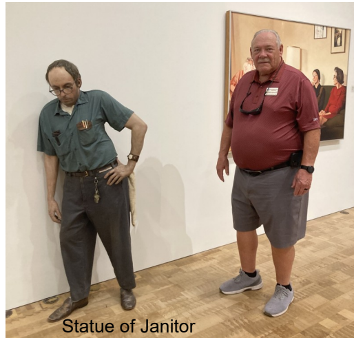
Statue of Janitor