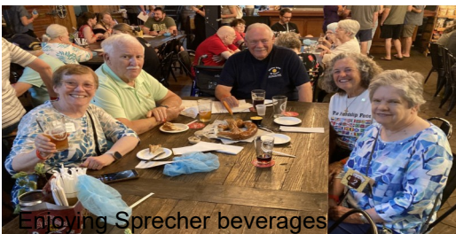
Enjoying Sprecher beverages

Friday morning was free to explore the city and visit with our hosts. Ambassadors enjoyed visiting quilt shops, touring Sprecher Brewing Company, learning to play Mexican train dominos, visiting a new children's park and strolling the river walk.