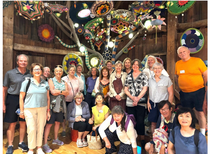
Quilts and Fiber Arts Museum in Cedarburg

The first outing was to Wisconsin Museum of Quilts and Fiber Arts Museum in Cedarburg. The executive director gave us an overview of its exhibits which change quarterly. We viewed many types of quilts and other fiber arts. Afterwards we enjoyed lunch and free time to explore the interesting shops. The day concluded with an outdoor play, The Inspector Calls , at Delafield Summer Theater in Lapham Peak State Park.