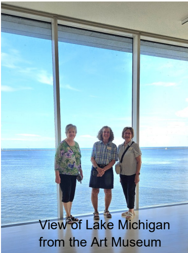
View of Lake Michigan from the Art Museum