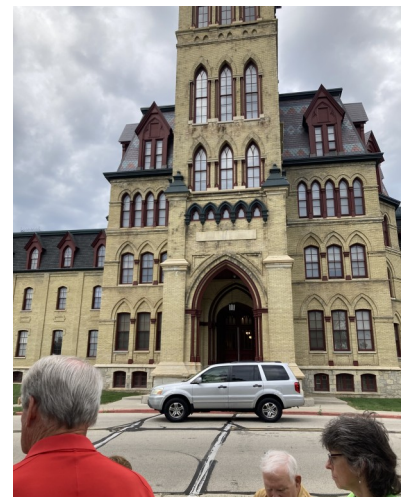
Views at Veterans Administration Housing at Woods