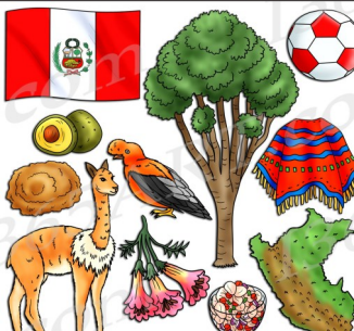
Peru National Symbols Clipart

Frascht-Miner jjbm526@aol.com 319-540-1701